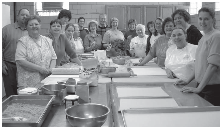
Baking for the St. Matrona Society Cookie Walk

Preparing for the 60th Convention, Cookie Walk, and MORE!