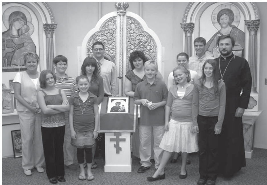
Greetings from St. Johns, Johnson City, NY!

This year is going to be exciting! Our officers are as follows :