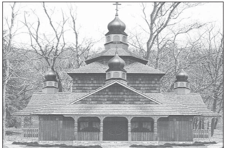
(Artists rendering of completed chapel)

Irene Carman, 315.785.9089, iccrph@twcny.rr.com