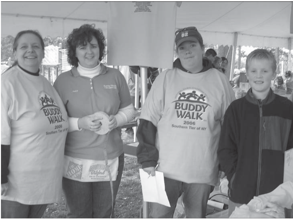
Jr. and Sr. UOL Members/Walk Participants