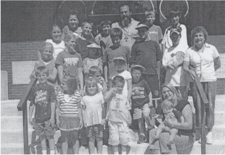
Participants in Palos Park Church School Camp-2006

They are truly wonderful examples of what Orthodox Christianity is all about.