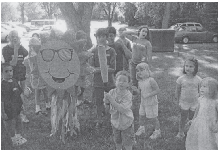
The piñata challenge was part of the fun and games!