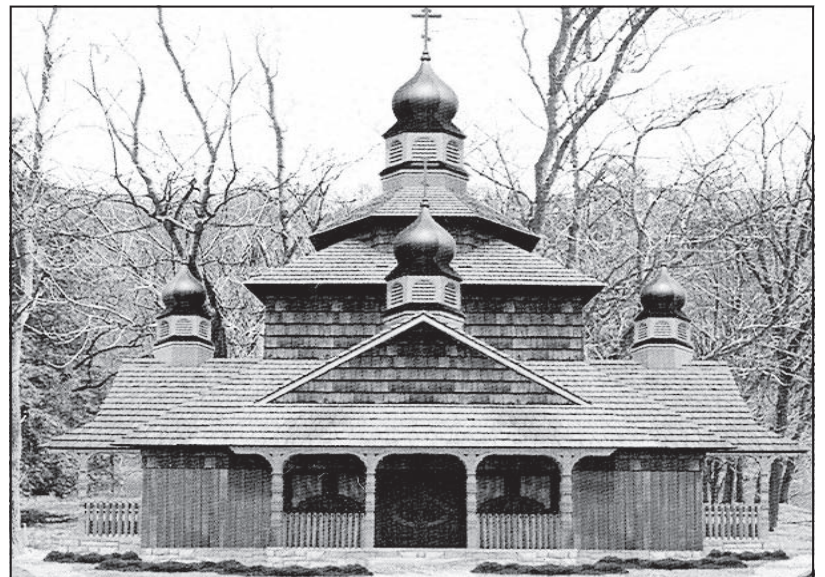
(Artists rendering of completed chapel)

Debra Burgan, 973-340-7586, deburgan@aol.com