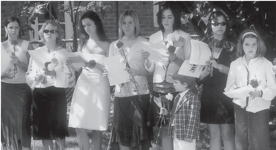
Readers from St. Vladimir's UOL Chapter

The Annual Commemoration for the victims of the Artificial Famine in Ukraine was sponsored by the youth of St. Vladimir's Ukrainian Orthodox Cathedral, Parma, Ohio. A memorial service was served outside, in front of the Famine Monument, followed by a program sponsored by the Sunday School, Taras Shevchenko Ukrainian School, and the Junior UOL Chapter.