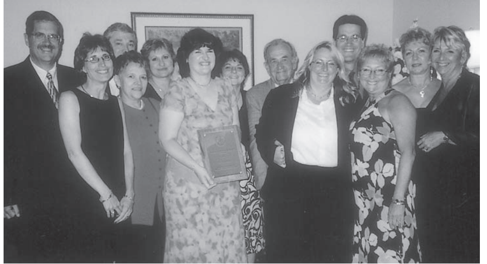
St. Vladimir Sr. UOL Chapter Members

The 2005 Sr. Chapter Achievement Award was presented to a chapter who truly embodies the mission of the Ukrainian Orthodox League . . . Dedicated to the Church, Devoted to its youth.