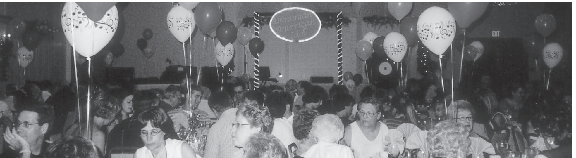
2005 Convention - Friday - "Ukrainian-American Idol Karaoke Kafe"