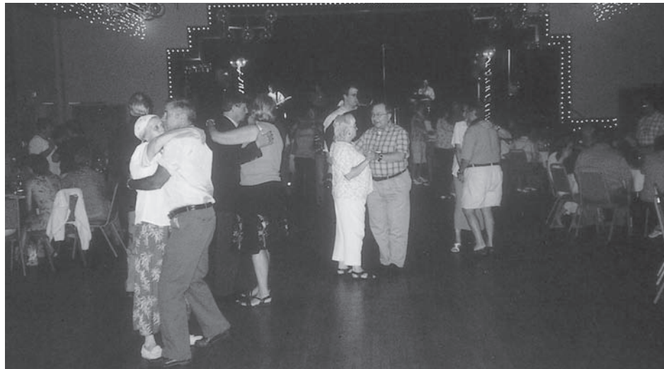
Thursday, “Blast From the Past”

THURSDAY: “Blast From the Past” Dinner Dance, held at the Northampton Community Center was truly “down memory lane” (as one junior remarked) for many of the UOL oldsters. In true Northampton style, the family style dinner provided the nourishment to sustain delegates and guests throughout a hectic convention schedule that was superbly planned by the Convention Committee.