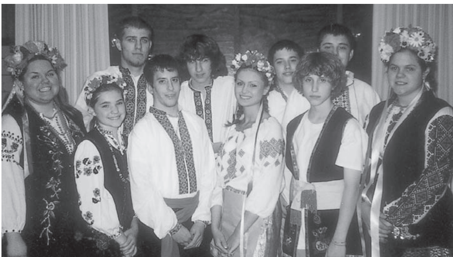
"Culture Fest" – Youngstown, OH

In addition to raising her three sons, she has touched the lives of the youth of her parish and the diocese.