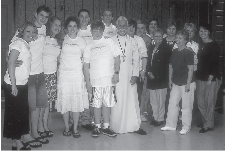
Sr. and Jr. National Executive Boards ('04-'05) May Battle of the Boards Competition

"Fund Raising for Carnegie Flood Relief"