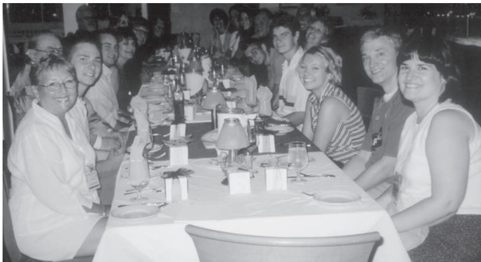
The Sr. and Jr. Executive Board Dinner Convention Opening Ceremonies