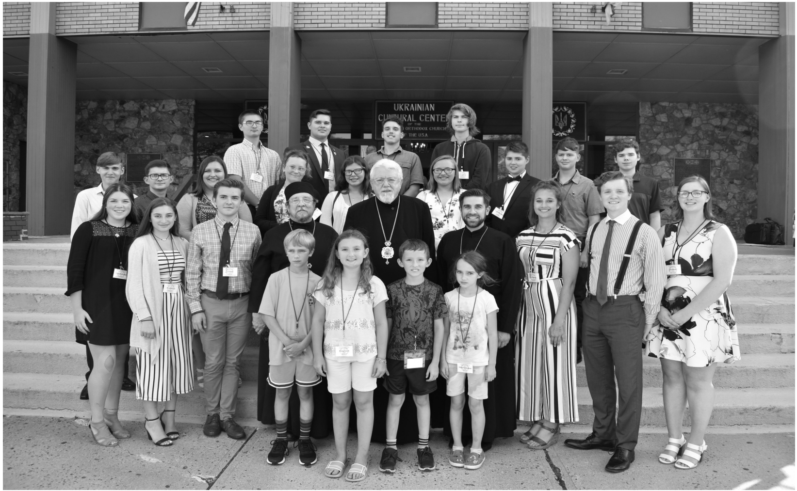
Junior UOL Convention - Centennial of the UOC of USA - South Bound Brook, New Jersey