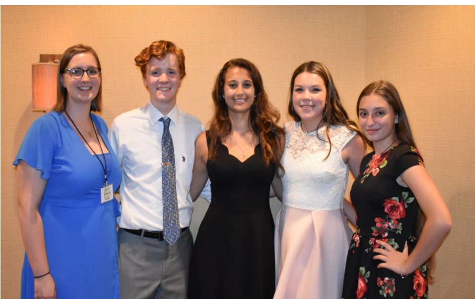
National Junior Executive Board 2018 –2019

The 2019 UOL Convention will start on Thursday, August 1 with registration opening at 3:00 pm. We will enjoy a wonderful dinner in the evening and have sessions on Thursday evening. Mark your calendars and can't wait to see you at All Saints Camp next August!