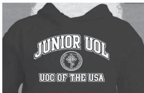
Previous Item of Apparel