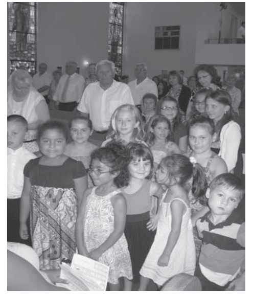
(Convention 2011 continued from page 5)