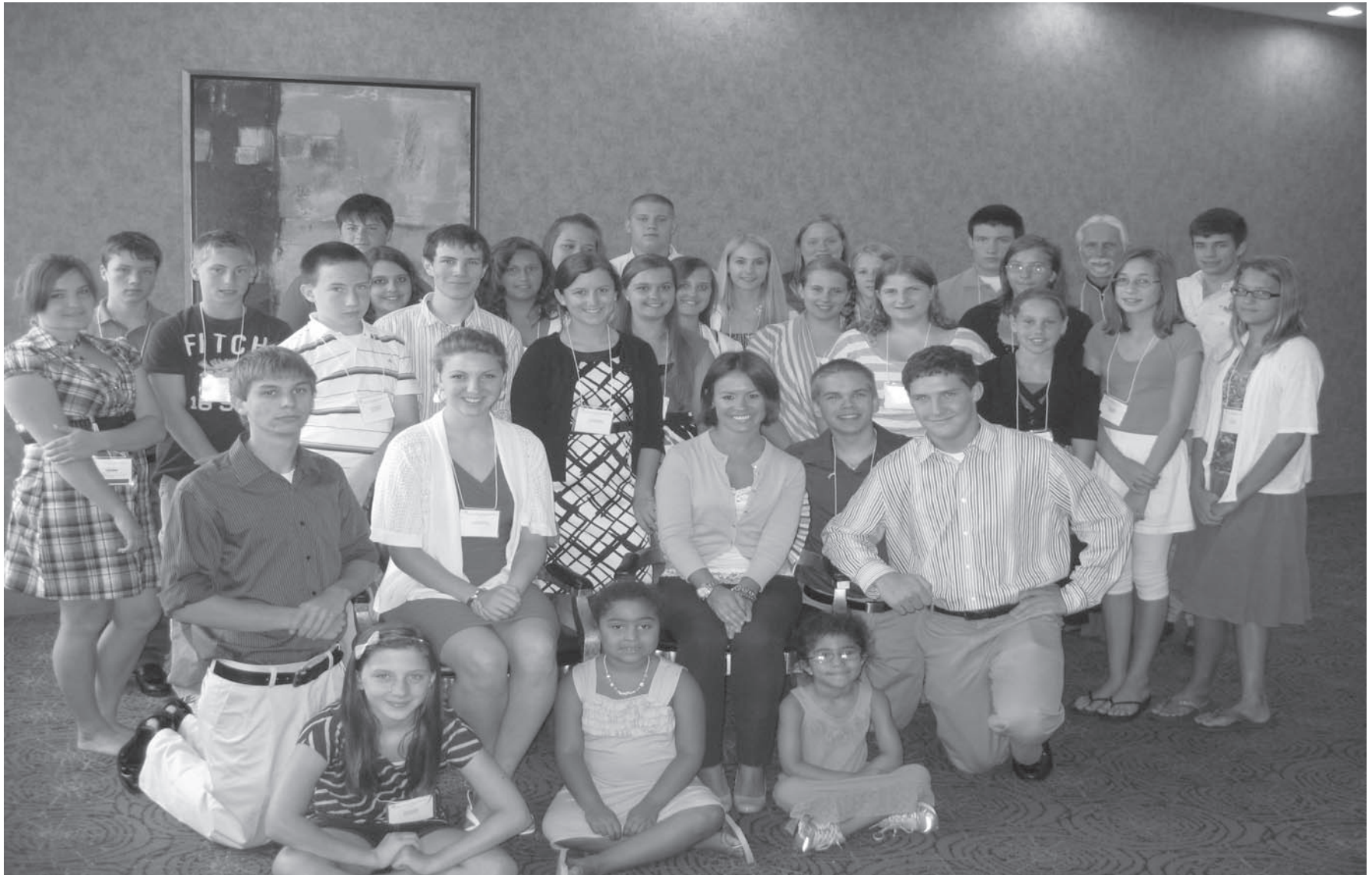
50th Annual Junior UOL Convention - Submitted by Katie Zimmerman