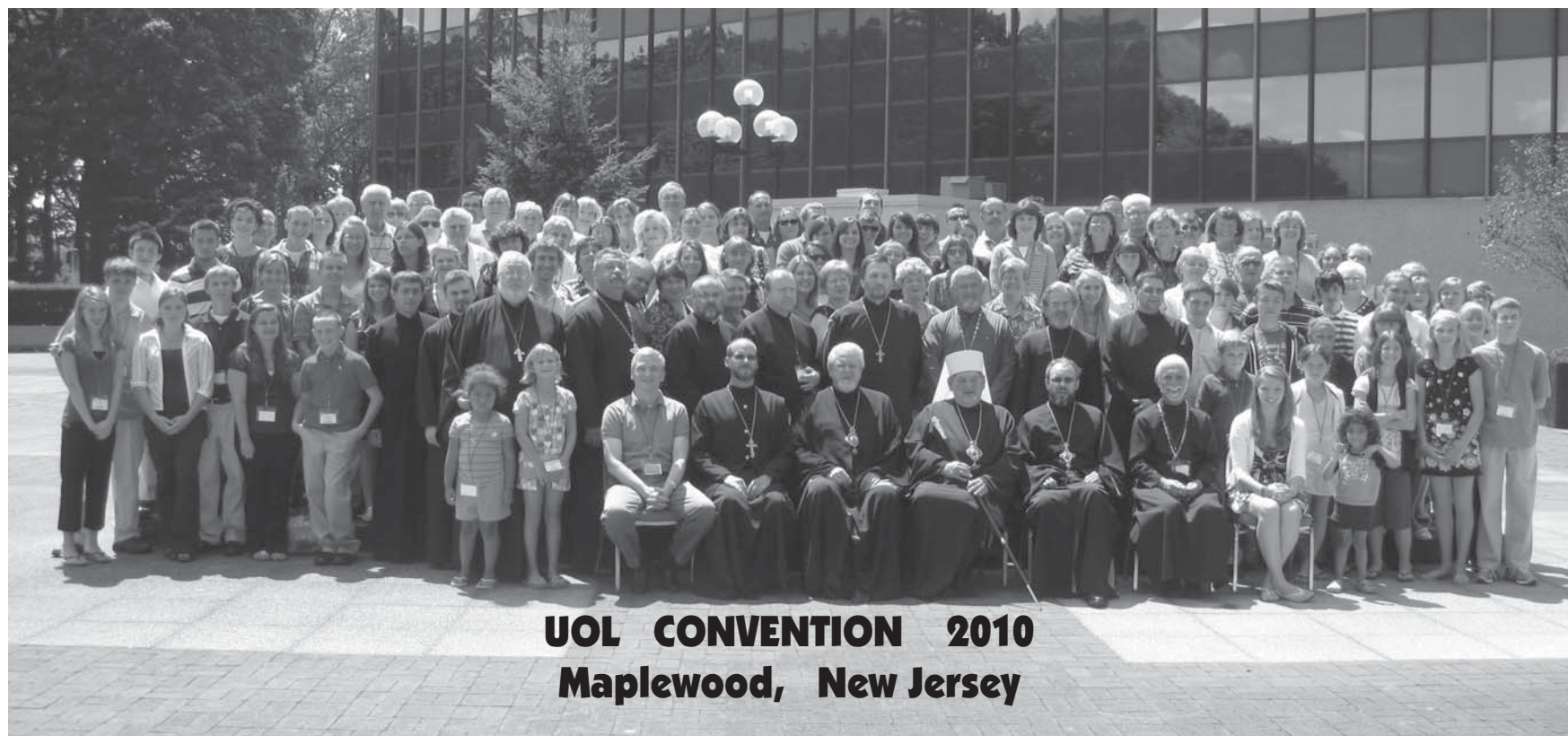
UOL CONVENTION 2010 Maplewood, New Jersey