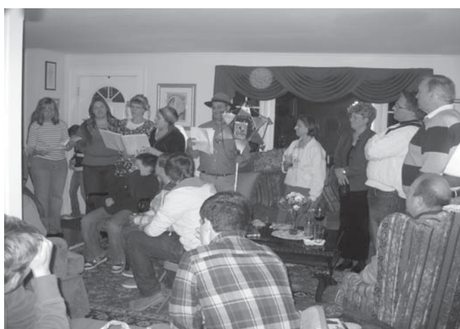
Maplewood UOL Members host UOL Executive Board Meeting and on Friday evening share their caroling with the Board.